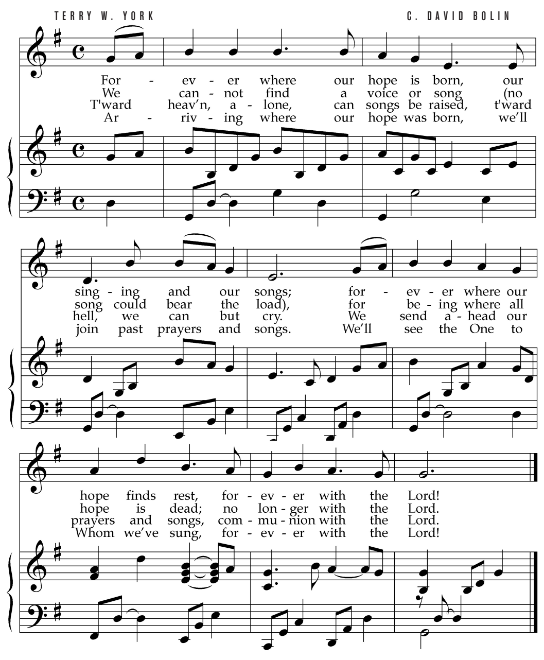
Tune: HIGHLAND 8.6.8.6.