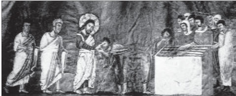
The Healing of the Man Born Blind. c. 575. Manuscript Illumination. Probably Constantinople or western Asia Minor. Codex Purpureus Rossanensis.

Only in the second portion of the story (9:13-35) do we learn that this miracle occurs on a sabbath. The Pharisees investigate the situation, but they cannot agree; some conclude that the healer is not from God because he does not observe the sabbath (9:16). Those who do not want to admit that the man was blind seek out and question his parents. Since the parents are afraid of "the Jews" who say anyone who calls Jesus the Messiah will be expelled from the synagogue, they reply that the man is old enough to speak for himself! The religious authorities question the man again, trying