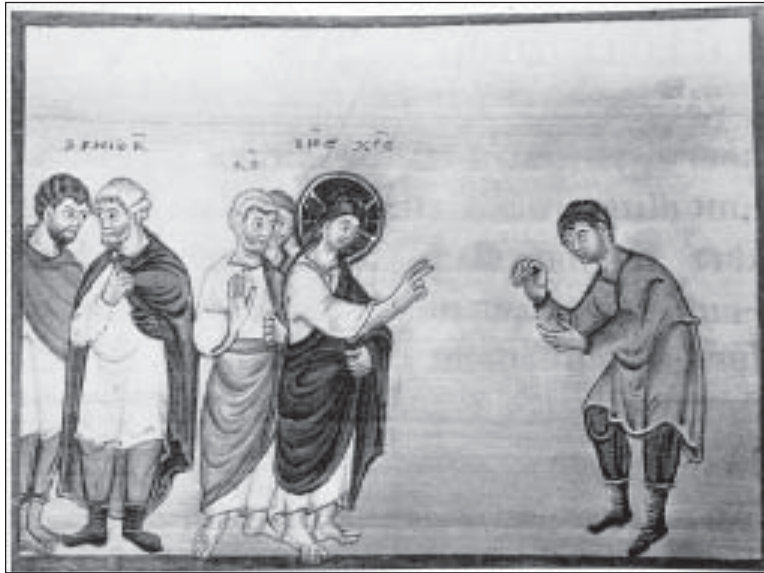
The Healing of the Withered Hand. c. 980. Manuscript Illumination. Reichenau School. Codex Egberti .

In this story the scribes and Pharisees are watching Jesus carefully in order to accuse him of violating the sabbath law. Despite this, when Jesus sees a person with a physical ailment, he calls him over, explains to the watching scribes and Pharisees why he should heal on the sabbath in anti-