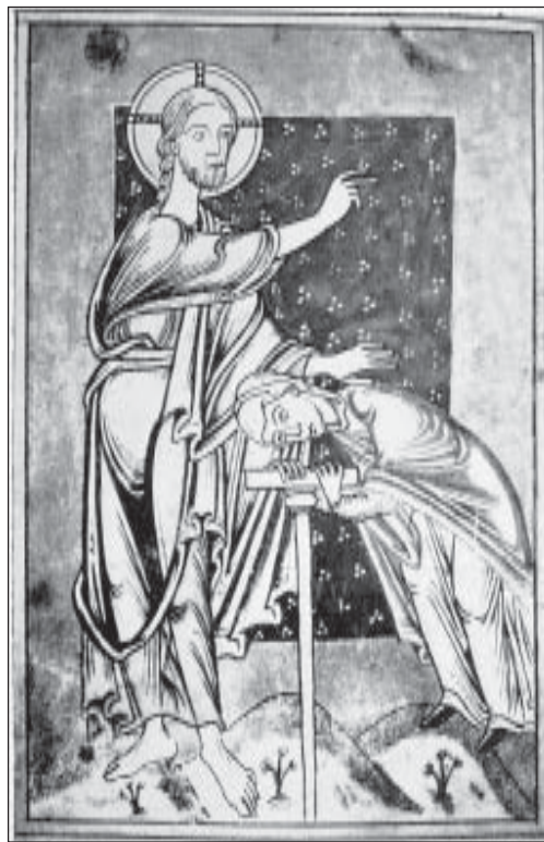
The Healing of the Crippled Woman. c. 1190. Manuscript Illumination. Central Rhine. Prayer Book of Hildegard of Bingen.

the sabbath. Jesus responds, "You hypocrites! Does not each of you on the sabbath untie his ox or his donkey from the manger, and lead it away to give it water? And ought not this woman, a daughter of Abraham whom Satan bound for eighteen long years, be set free from this bondage on the sabbath day?" (13:16).