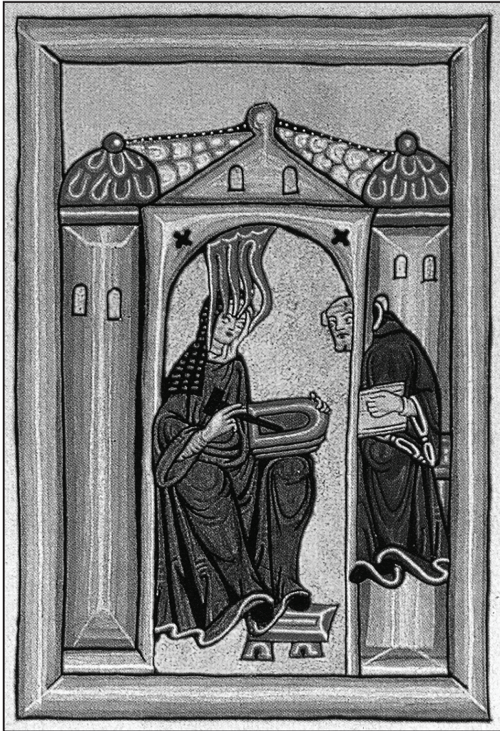
Figure 1: Hildegard of Bingen (1098-1179), Scivias, plate 1: THE VISIONARY.

In her Scivias preface, Hildegard shares how the divine Voice commanded her to articulate what she had seen and heard in her visions, to help others come to know God: