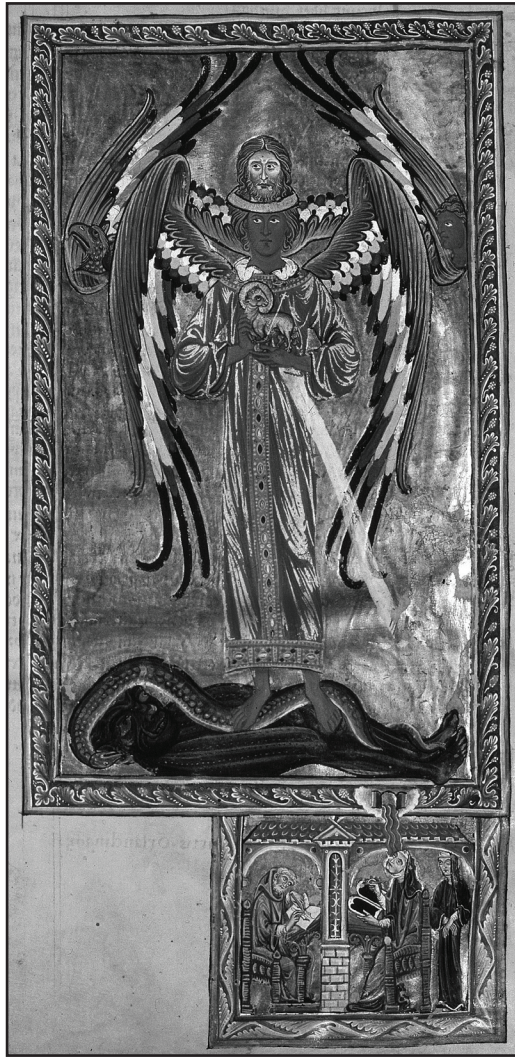
Figure 2: Hildegard of Bingen (1098-1179), Book of Divine Works, I.1: ON THE ORIGIN OF LIFE.

"Holy-Spirit fire" also informs Hildegard's poetry, sung liturgically. In it, she praises the Holy Spirit's life-sustaining strength and wisdom: