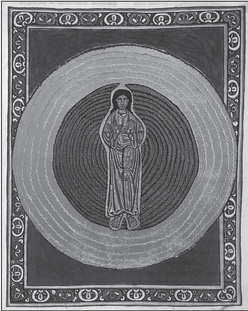
Figure 4: Hildegard of Bingen (1098-1179), Scivias, plate 11: THE BLUE CHRIST. Public domain.

You bring people together. You curl clouds, whirl winds, send rain on rocks, sing in creeks, and turn the lush earth green. You teach those who listen, breathing joy and wisdom into them.